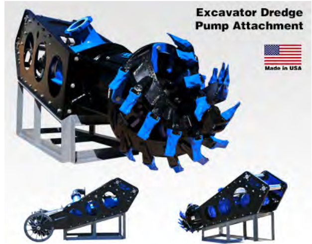
Typical Attachment Photo. Dredge pumps can be deployed vertically or horizontally. Contact us for further details. Photos for general guidance.

12-Inch EX 12000 Excavator Attachment Specs.