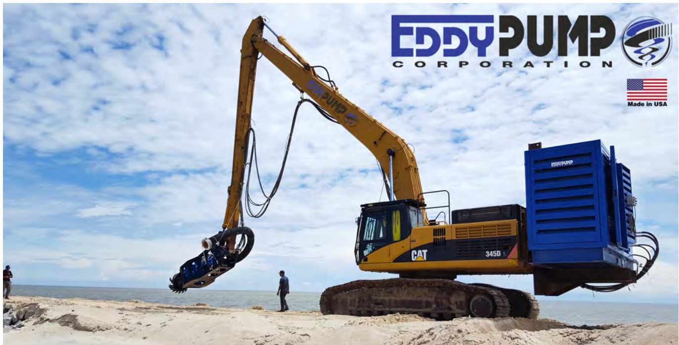
CAT 345D - Excavator Dredge Pump Attachment - 500 HP Hydraulic Power Unit

EDDY Pump industrial Excavator Dredge Pump Attachments are non-clog pumps designed for high solids industrial pumping applications. Our patented pump technology outperforms all centrifugal, vortex and positive displacement pumps in a variety of the most difficult pumping applications.