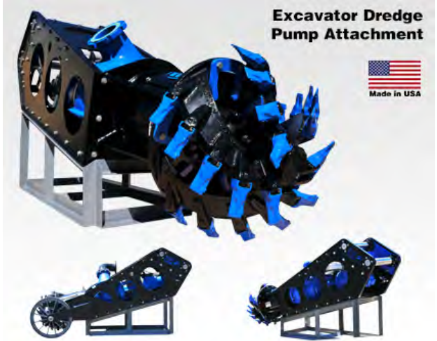
Typical Attachment Photo. Dredge pumps can be deployed vertically or horizontally. Contact us for further details. Photos for general guidance.