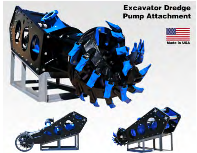
Typical Attachment Photo. Dredge pumps can be deployed vertically or horizontally. Contact us for further details. Photos for general guidance.

8-Inch EX 8000 Excavator Attachment Specs.