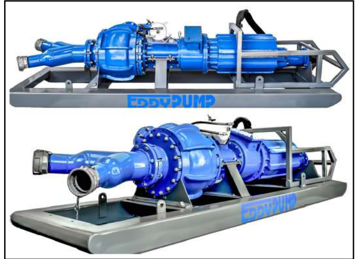
*Typical Deployment Photo. Photos for general guidance. Contact us for further details.