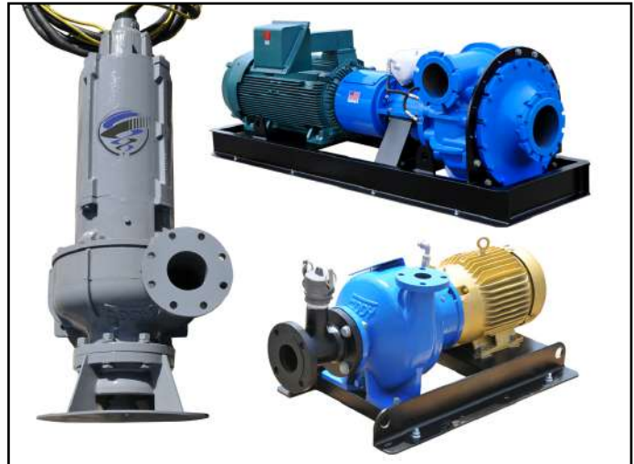
*Typical Deployment Photo. Dredge pumps can be deployed vertically or horizontally. Photos for general guidance. Contact us for further details.