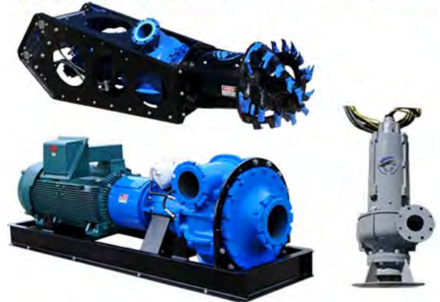
Typical Eddy Pumps. Process pumps and dredge pumps can be deployed vertically or horizontally. Contact us for further details. Photos for general guidance.