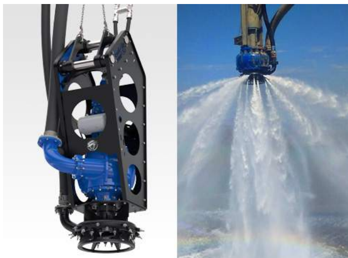
*For illustration purposes hydraulic and electric powered units are featured.