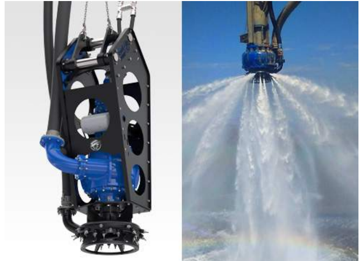
*For illustration purposes hydraulic and electric powered units are featured.